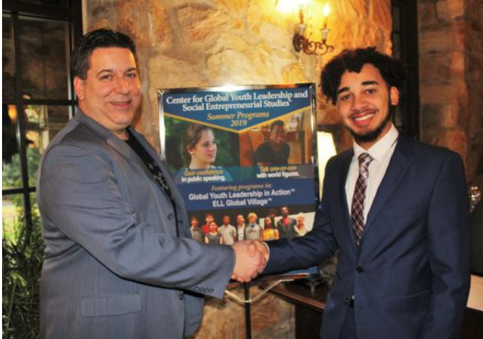
Future Leaders announce Partnership with Brandon Hall

At the end of the programme, rather than being given a formal examination, all students were required to present their skills from memory, in an interactive "teach the audience" styled closing ceremony. Their presentations incorporated all seven units from the curriculum, along with the practical components of field experiences and seminars with community leaders.