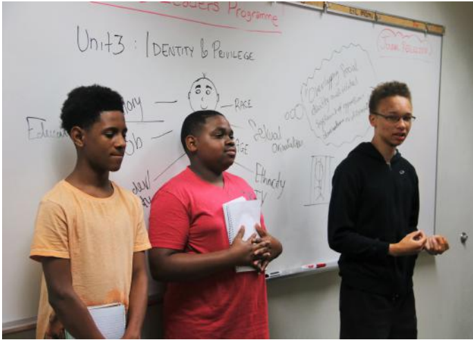
Students make a presentation on the Matrix of Power and Oppression.

For three weeks, each of our Future Leaders completed over 90 hours of academic study, hands-on education and meaningful service to local organisations as they embarked on a mission to develop the knowledge, experience and leadership skills they need to make a positive change in the community.