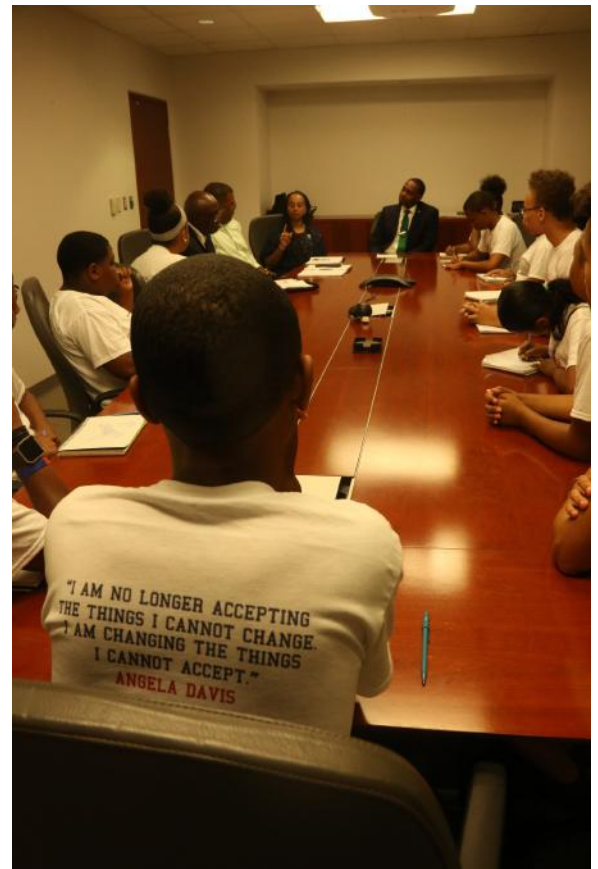
Premier Burt hosts a Q&A Session at the end of the programme.

Students make a visit to Drug Treatment Court after an intense discussion on the Mincy Report.