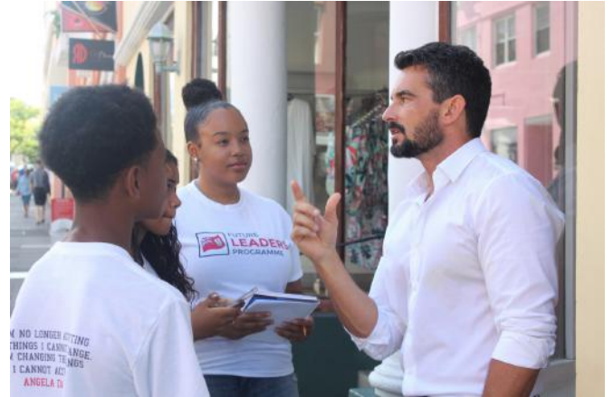
Students hit the streets of Hamilton to survey residents on issues that matter most to them in the community.