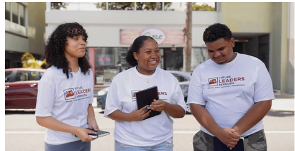
Future Leaders attended a focus group with the Human Rights Commission