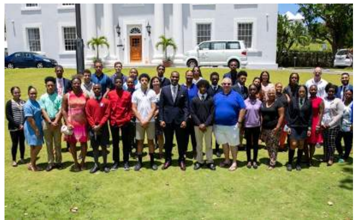
Incoming 2022 Future Leaders with platinum sponsors HSCM Bermuda, and Premier Hon. E. David Burt, JP, MP.