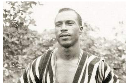
(Nov 28, 1932 – May 29, 2020)

He is best remembered locally for his work with universal adult suffrage and the Black Power conference of 1969.