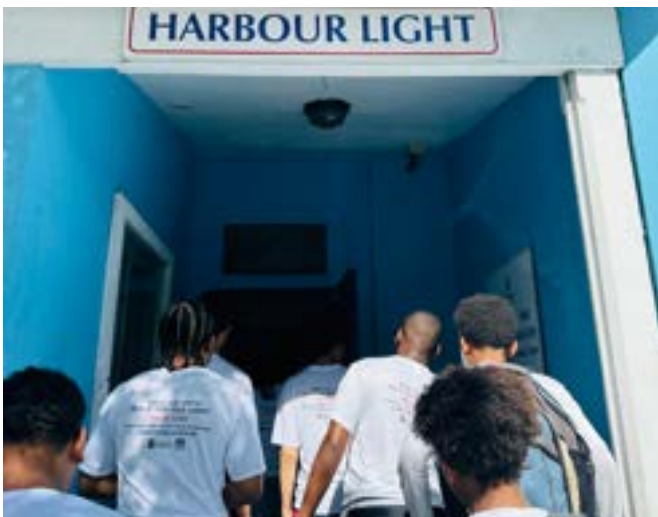
Students visit shelters and rehabilitation services to better understand the interplay between poverty and inequality.