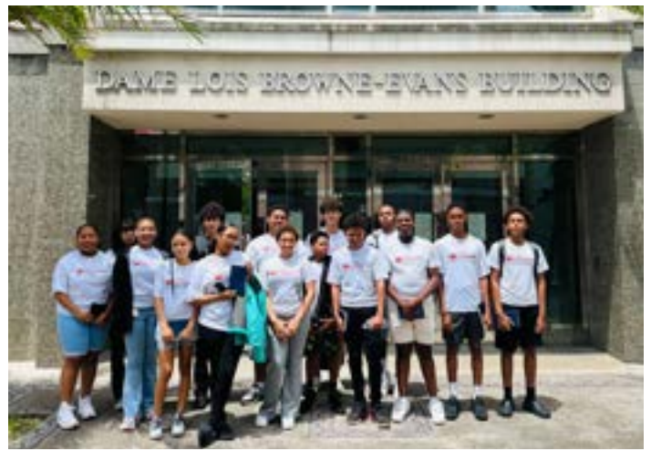
Future Leaders attend drug court proceedings, identifying the intersection between Crime & Inequality.