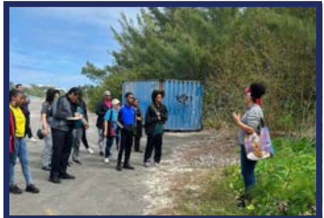
Bermuda Wild Plants & Herbs led Future leaders on an interactive walking tour and vegan tasting session.