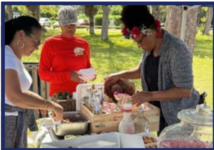
Bermuda Wild Plants & Herbs organised an intriguing Nutrition & Meal planning workshop.