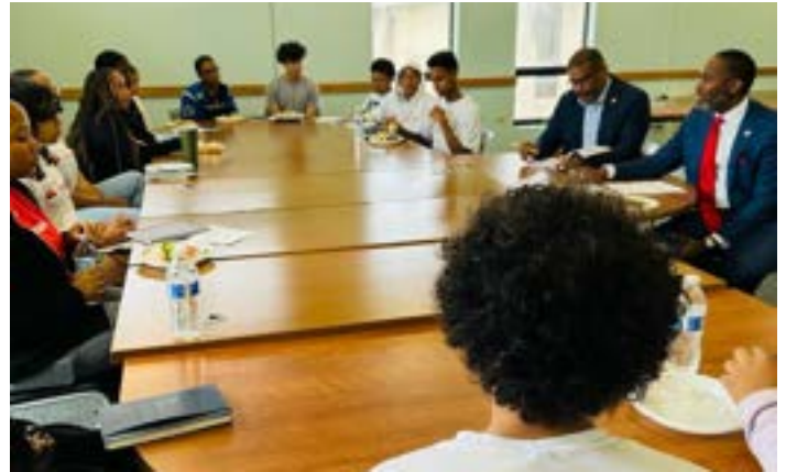
Incoming 2023 Future Leaders with Premier Hon. E. David Burt, JP, MP, and Minister of Education Hon. Diallo Rabain.