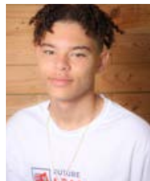
Kingston Lekki 2023 Future Leader