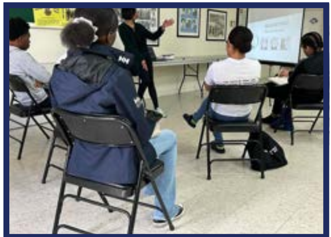
Pocket Change Bermuda enlightening students on tips for generating and maintaining wealth.