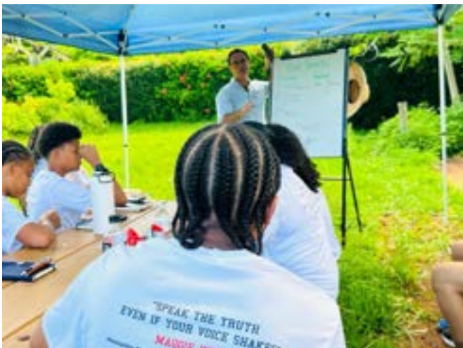
Agra-Living Institute workshop teaches Future Leaders the importance of food security and the benefits of understanding the appropriate seasons to plant.